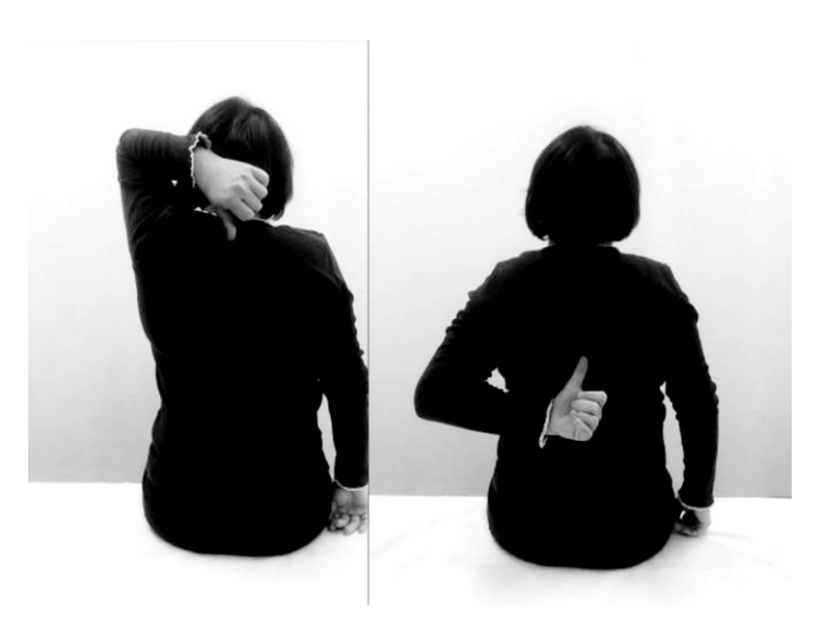
Figure 2. Back scratch test

Downward scratch test is to reach behind the head and touch the spine with the thumb as far as possible (shown in left figure); upward scratch test is to reach behind the back and touch the spine in the same way (shown in right figure). The distance from top of C7 spinous process to the tip of thumb was measured.